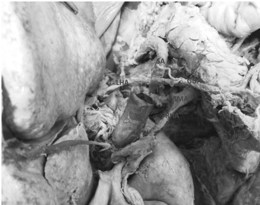
Figure 1: Showing Coeliac Trunk Dividing into Left Hepatic Artery, Splenic Artery and Gastroduodenal Artery. Right Hepatic Artery was Observed to Be Arising from Superior Mesenteric Artery. Lha: Left Hepatic Artery. Ct: Coeliac Trunk. Sa: Splenic Artery. Gda: Gastroduodenal Artery. Sma: Superior Mesenteric Artery. Rha: Right Hepatic Artery.

were described.[5] Variations in the branching pattern of superior mesenteric artery is also been observed. In about 50% of cases, the marginal artery which is the result of anastomosis of the branches of superior mesenteric artery and inferior mesenteric artery may be discontinuous because of the failure in the anastomosis between the left and right colic arteries.[6] There have been reports of cases where the right and middle colic