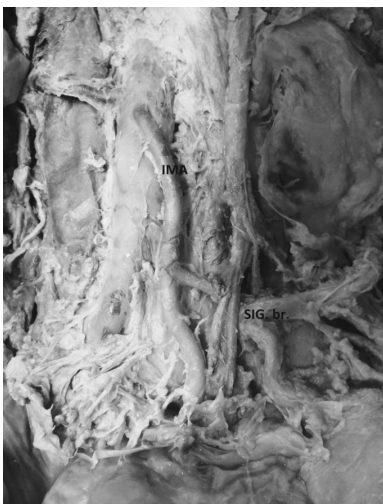
Figure 6: Showing Absence of Left Colic Artery and Inferior Mesenteric Artery Giving Arise to only Sigmoidal Branches

wall was opened, and peritoneum and viscera were carefully separated. The course and branches of all the ventral branches of aorta was traced. Any arterial variation was observed and recorded.